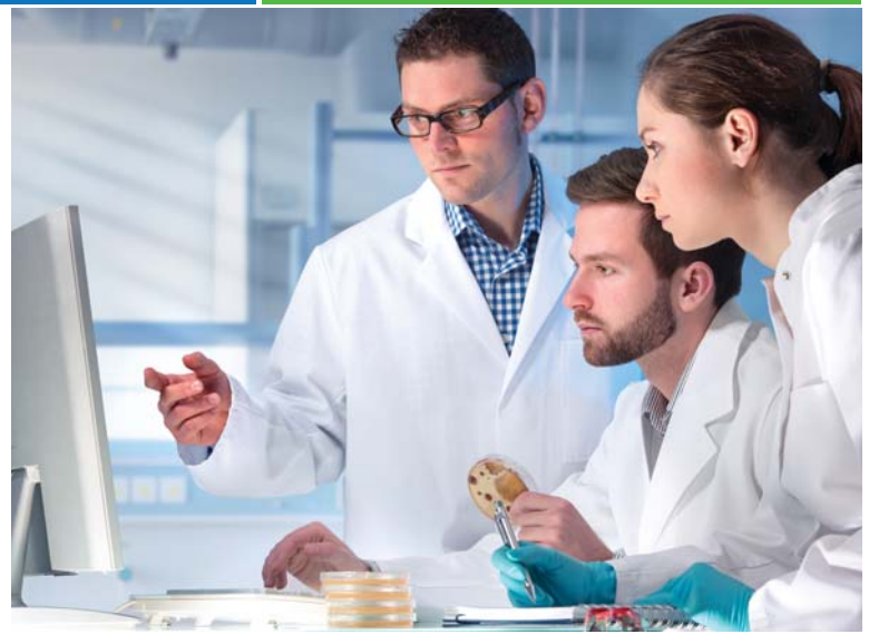
Patient Care Technician